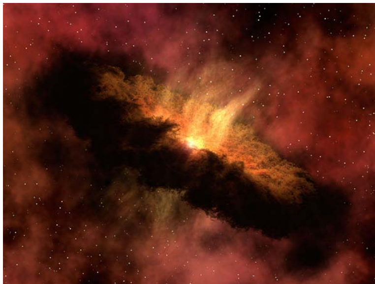
Figure 1: Artists impression of the young Star NGC 1333 IRAS4B. Scientists assume that planets form in the surrounding disk. For the first time they were now able to detect large amounts of water in this disk.

While astronomers cannot turn back the clock to observe our own young solar system, they can study planetary systems in formation around other nearby young stars. The IRAM Interferometer on the Plateau de Bure in the French alps has pinpointed for the first time the location of the bulk of the hot water vapour in the rotating disk around a very young star, analogue to our Sun.